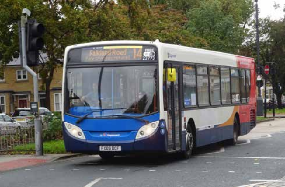
Pictured operating route 14 in Hull is Stagecoach East Midlands MAN/Enviro 300 22773, one of seven vehicles of the type transferred to Hull in exchange for ADL Enviro 300s.