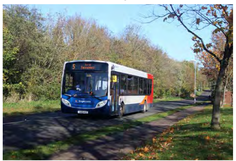
Stagecoach East has transferred ADL Enviro 300s 27642-47 from Bedford to Cambridge and pictured working a Cambridge Citi 5 service to Swavesey is 27646. This batch of Enviro 300s started life with Stagecoach South being transferred to the Norfolk Green operation at King;'s Lynn when it was managed by Stagecoach South. Upon the closure of King's Lynn depot all six vehicles were transferred to Bedford.