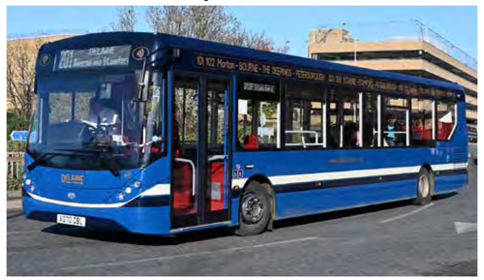
The newest vehicle in the Delaine Buses fleet is 167 (AD70DBL), an 11.8m ADL Enviro 200MMC - the first of its type for the Lincolnshire-based operator. It will be followed in 2021 by a second example.