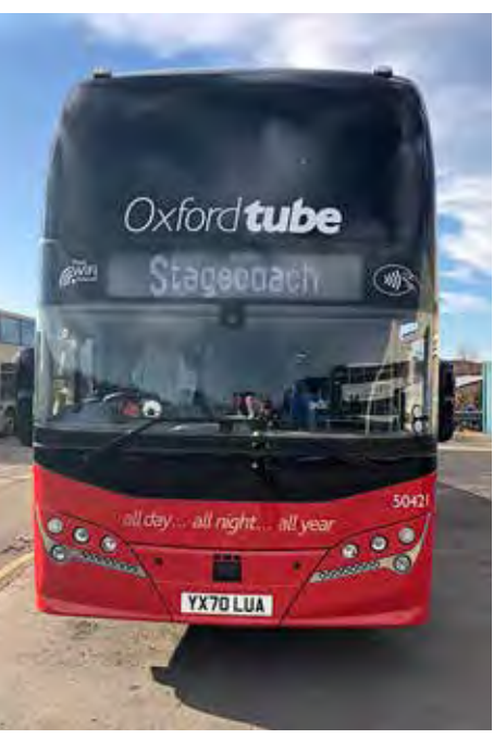
The first of the 34 new Volvo BIIRLE/Plaxton Paramount coaches for the Oxford Tube service have now been delivered to Stagecoach Oxfordshire. Pictured on arrival was 50421 (YX70LUA), which will be re-registered before entering service See Page 16 for full registration details..